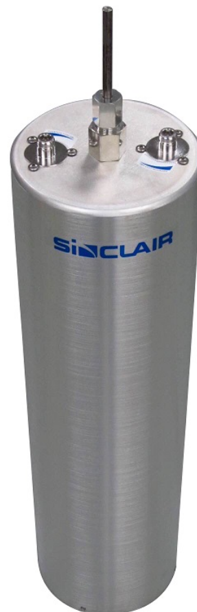
Filter may not appear exactly as picture.